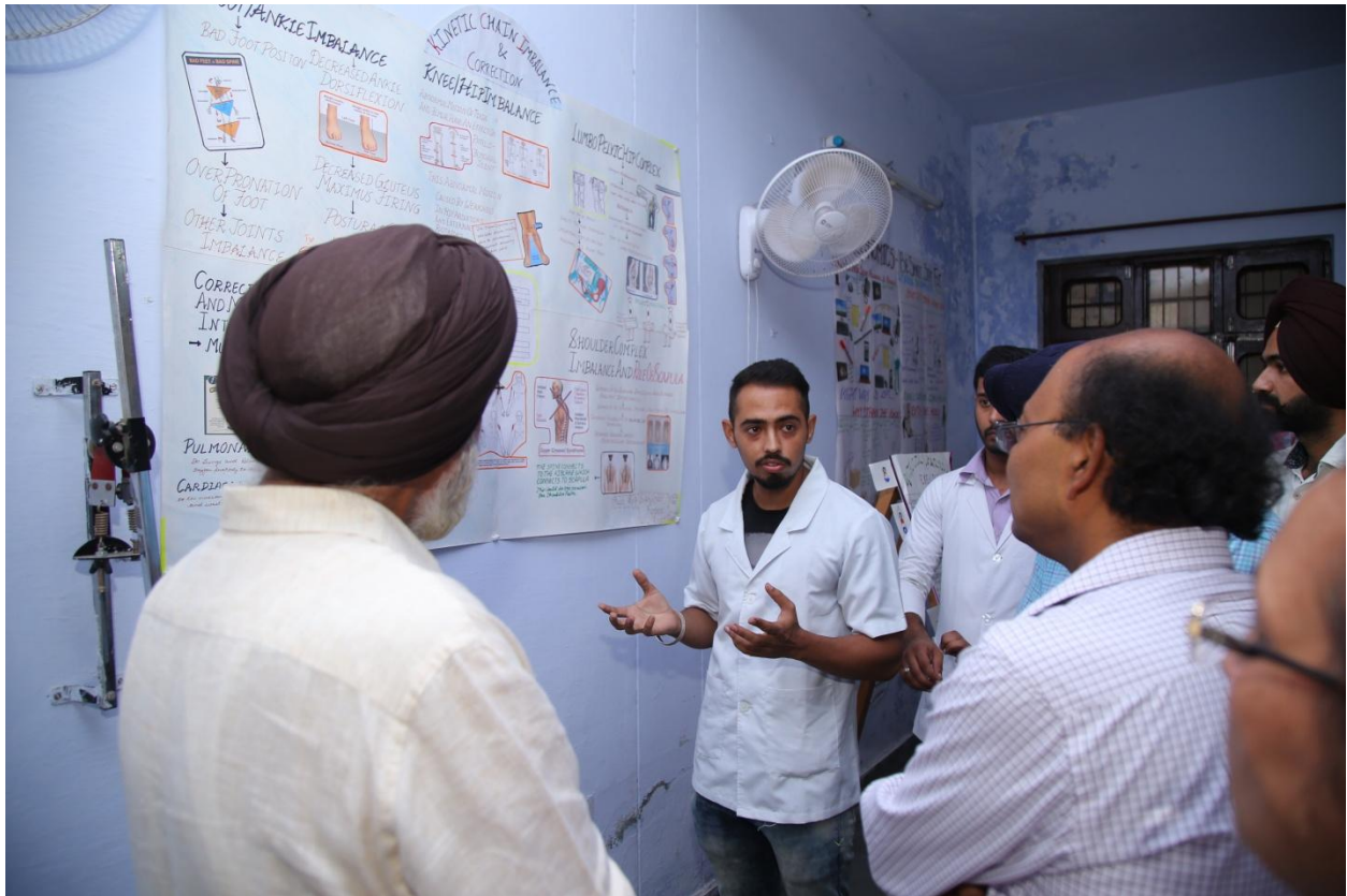
Model Presentation Competition