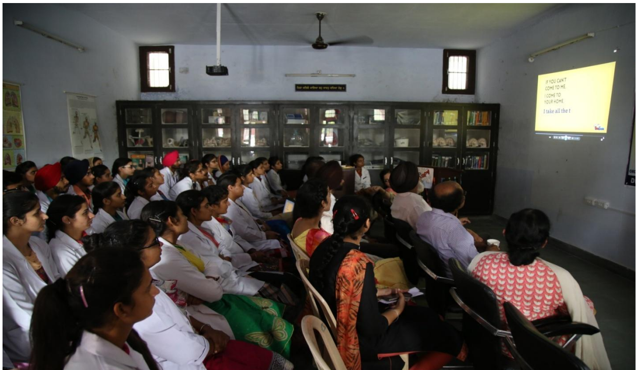
Chief Guest, Principal Sir, Heads of various departments, Physiotherapy staff and students attending animated video revealing the significance of World's Physiotherapy Day.