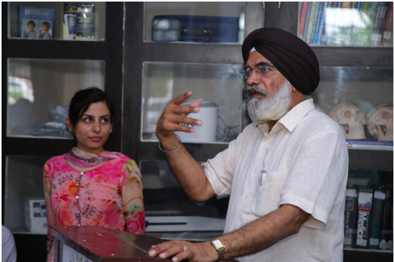
Respected Principal Sir addressing the Students of Physiotherapy Department.