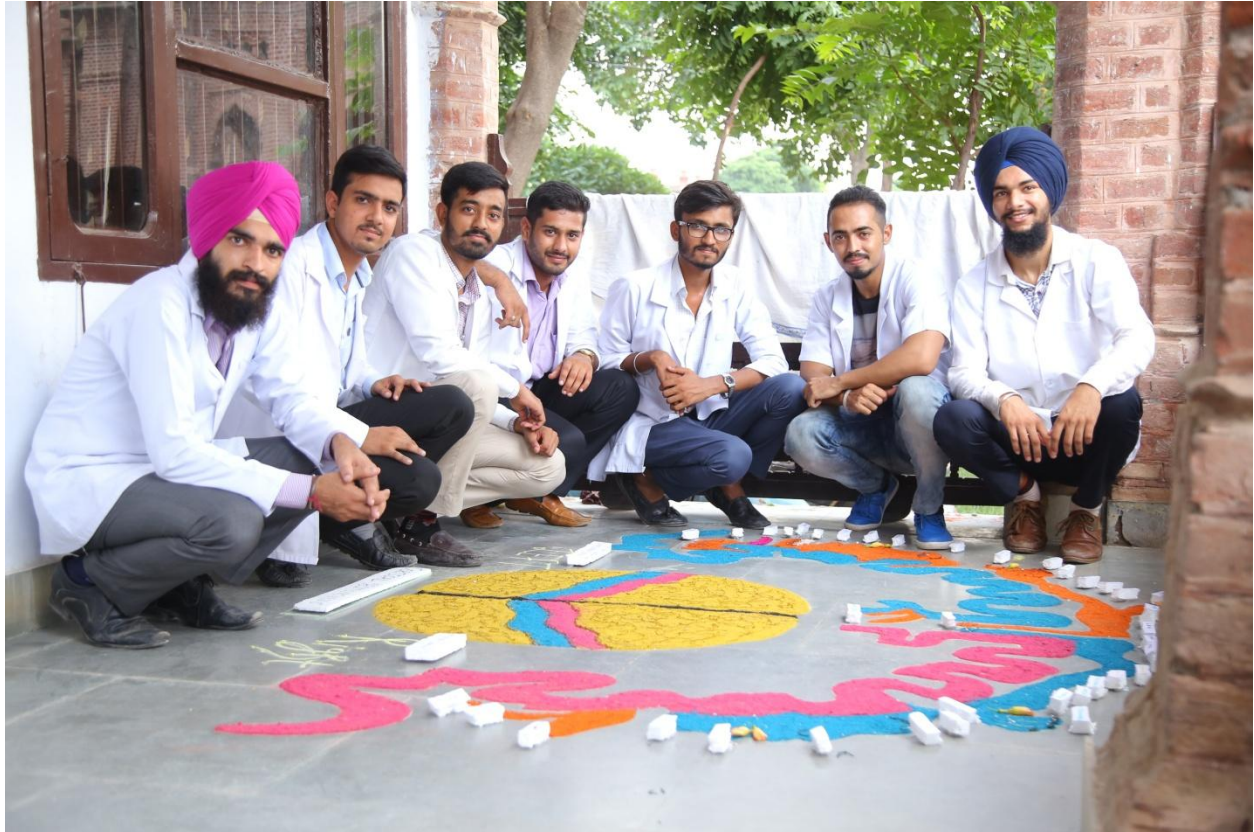
Winners of Rangoli Competition